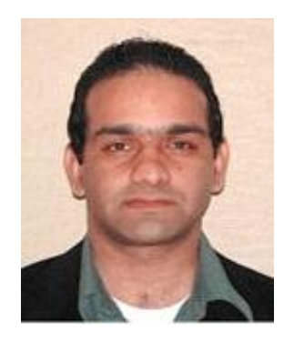
Murad Ashraf Janjua (IDS '03) Consul Consulate General of Pakistan in Istanbul, Turkey