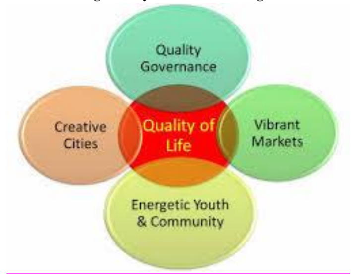
Fig. 2. Key Institutional Changes

Following North (1990) and Romer (1990) we are seeking the key institutional changes that will allow behavioural changes for better outcomes. These are illustrated very simply in the logo of the FEG.